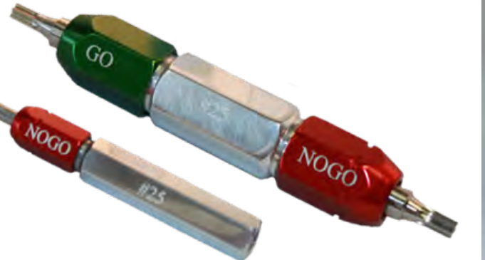
Go / No go Gauge for Testing a Product Feature

In general, a test should be targeted at detecting something on the product that is most likely to fail or that is not to specification.