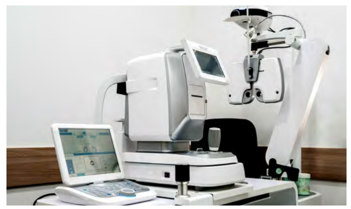
Automated Optical Test Machine