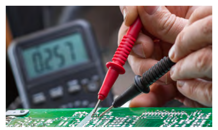
Manually Testing a Circuit Board

Product Testing is a process of measuring the properties or performance of products. It is not to be confused with product inspection. Product testing, often known as lab testing, typically involves testing a product against a specific standard or regulation in a certified laboratory. Whereas product inspection often involves checking a random sample of an order for compliance with a buyer's requirements and specifications.